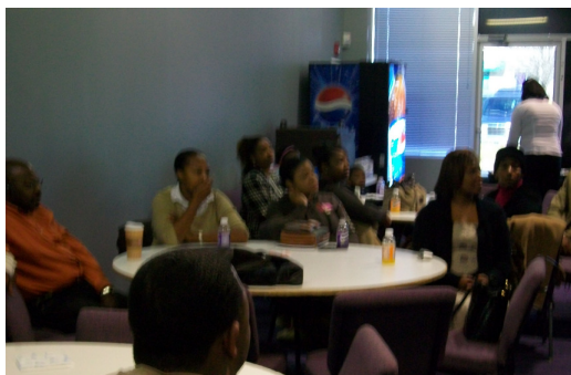
Glad Tidings Missions Awards Breakfast